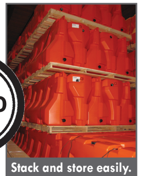
Stack and store easily.